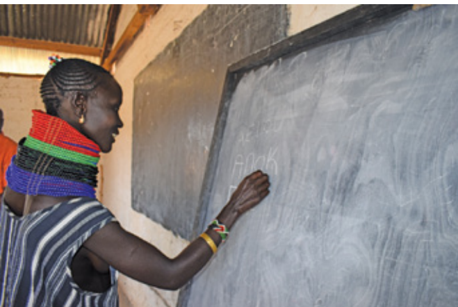
A Turkana Lady learning how to write on the blackboard.