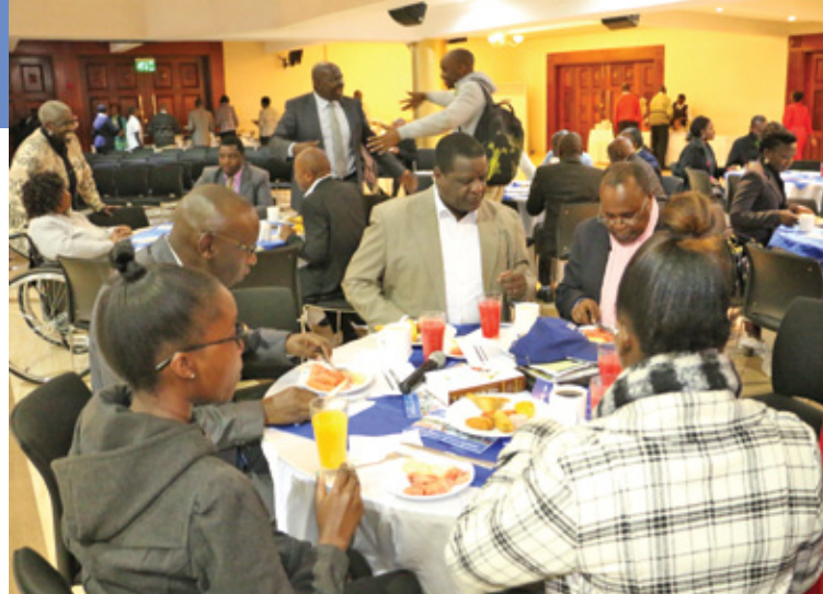
Members interacting during the breakfast forum held at All Saints Cathedral Church

She added that the platform allows one to register for membership, donation towards Bible Work and pay membership subscription. The potential members were encouraged to register for the service and begin the process of becoming members of BSK.