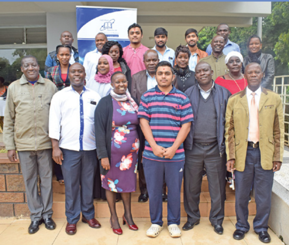
Group photo of all participants