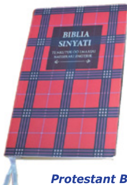
Protestant Bibles - Ksh 870