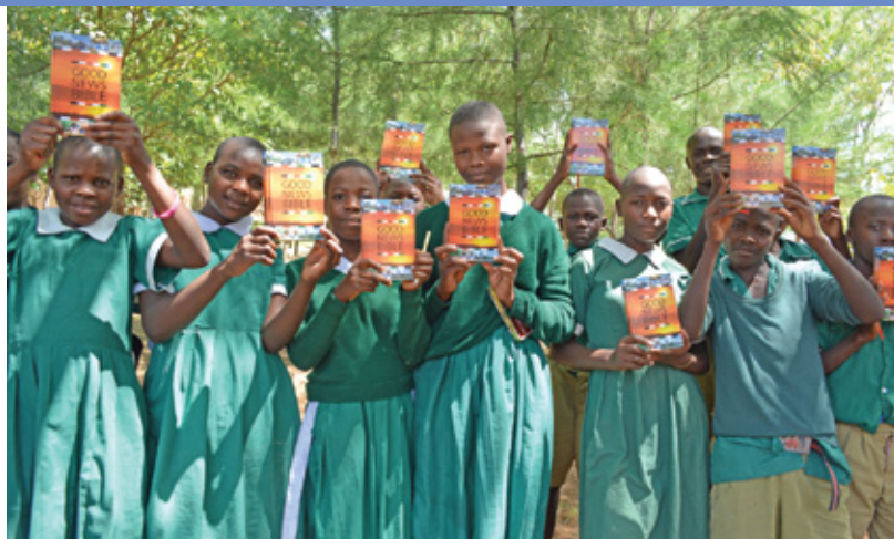
Students at Ebuchira Primary School express their joy after receiving Bibles from Bible Society of Kenya

Bible Society of Kenya in partnership with the Netherlands Bible Society responded to the lack of Bibles by distributing 811 Bibles to students in three schools in Kakamega County including; Ebuchira, Malaba and Emabole Primary schools. Additionally 3,545 Bibles were distributed to other Counties including Baringo, West Pokot, Kajiado and Nairobi. The recipients of the Bibles expressed their gratitude to Bible Society of Kenya for helping them to grow spiritually.