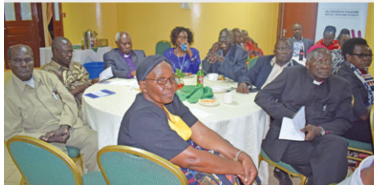
Members interaction forum in Kisumu at Jumuia Hotel