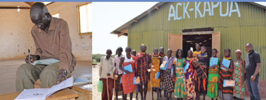
An old man doing his assignment at Namoruputh