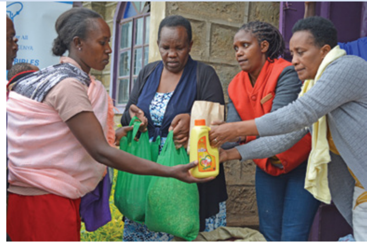
A lady who survived the Solai tragedy receives food from BSK