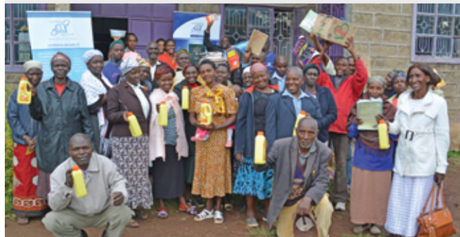
Joyful faces from Solai residents after receiving food stuff, clothes, stationary and spiritual nourishment from Bible Society of Kenya