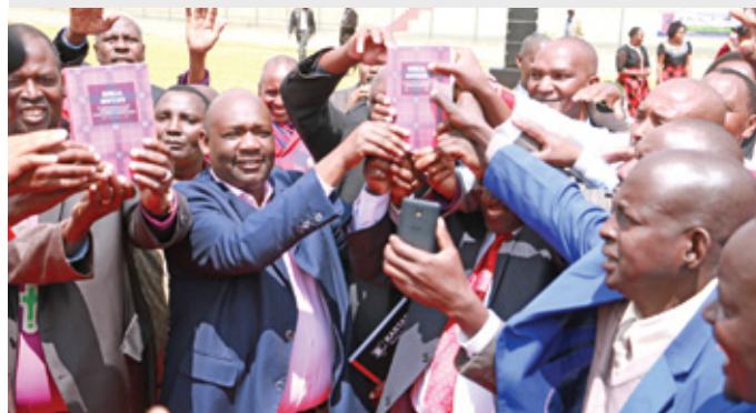
Church leaders and County Government officials receive the unveiled revised maasai Bible