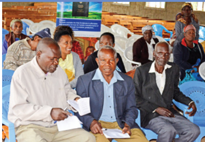
Training session going on

After the training sessions, each participant received a pack of food, clothes and books and they were overjoyed by the kind gesture. We thank all our supporters for their kind donations and we look forward to be the good Samaritans to our brothers and sisters in Solai.