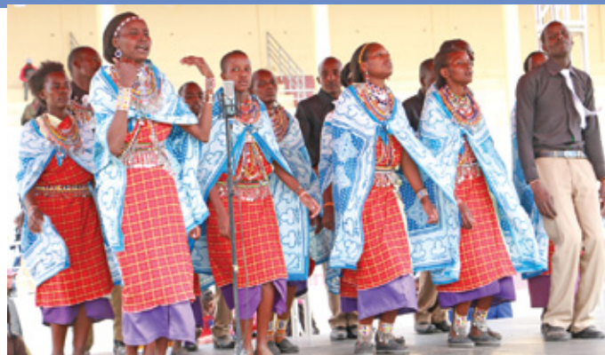
Choir performing during the launch

The Bible Society of Kenya has lined up a number of translation projects to cater for various local communities to ensure preservation of indigenous local languages through scripture transformation and Bible work.