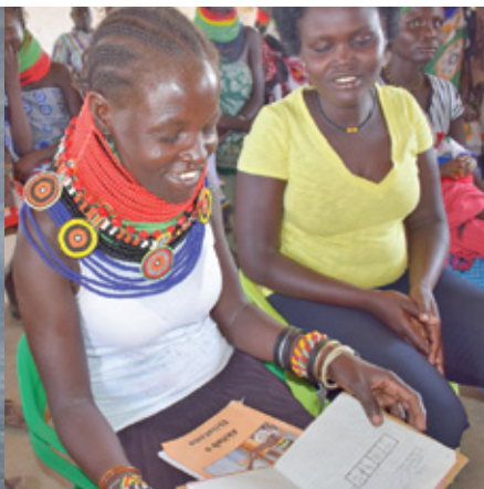
The lady smiling and enjoying her studies at Namoruputh

Learning in Central Turkana is a dream yet to come true.