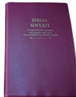
Deuterocanonical Bibles (Catholic edition) - Ksh 986