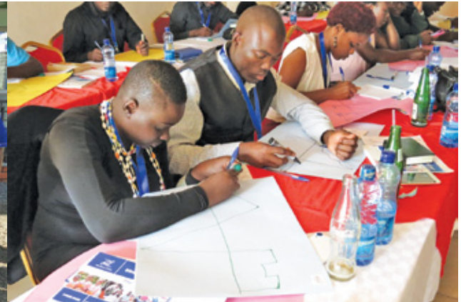
Class session at ABLI Nairobi cohort