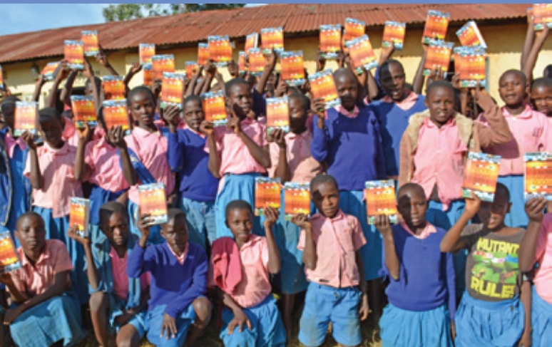
Emabole Primary School students pose for a photo after receiving their Bibles