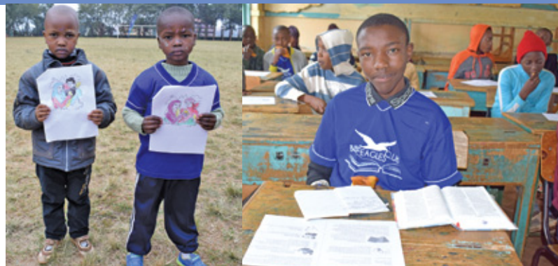
Children from pre-school show off their drawings during the Bible study session

The theme of this event is drawn from the book of Isaiah 40:31 which states that "they will rise on wings like eagles."