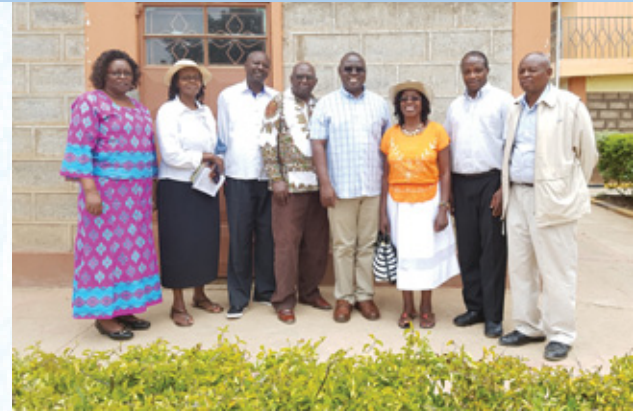
Machakos Branch AGM

The General Secretary appreciates BSK branches and looks forward to launching even more branches soon so as to expand the work of BSK to the grassroots. Thanks to all BSK members for their untiring support to seeing the Society grow to greater heights! May God richly bless you.