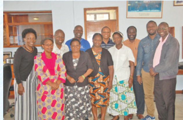
Nairobi Branch AGM 11th March 2017