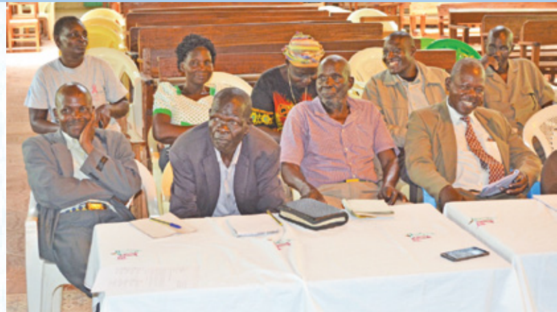
The Pastors keenly following the discussions

A coalition of pastors from Banyala speaking group approached BSK requesting to have a Bible translated in Kinyala, as they could not fully relate with the other existing Luhya Bibles which include; Lunyore, Lubukusu, Logooli, Lukakamega; Luterichi / Lwitakho / Lwisukha and Oluluyia Bible (for the Marama / Shisa / Tsotso / Wanga). Following the request, BSK planned for a meeting with Church leaders in Navakholo Kakamega County to forge a way forward on the possibility and necessity of the translation project for the Banyala. The meeting took place on 6th March 2017 at Friends Church Chebuyusi, and 20 pastors from various denominations in the region were in attendance.