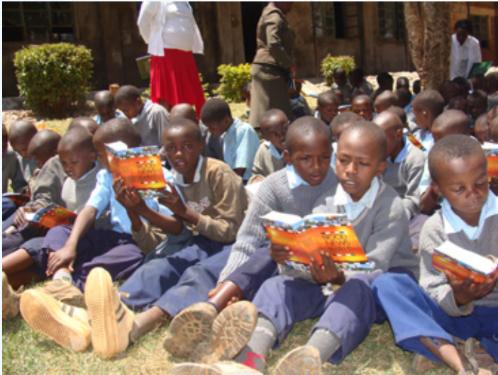
Children at Kianjokoma Primary school enjoy reading Bibles donated by Bible Society of Kenya