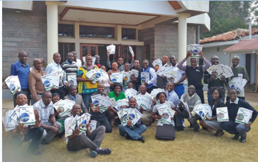
PPI workshop participants holding the PPI books

BSK plans to implement the PPI programme in 10 schools, and train 100 teachers in 2017. The first training is scheduled for 25th February 2017 at St. Luke's ACK Church in Muthurwa, Banana, Kiambu County.