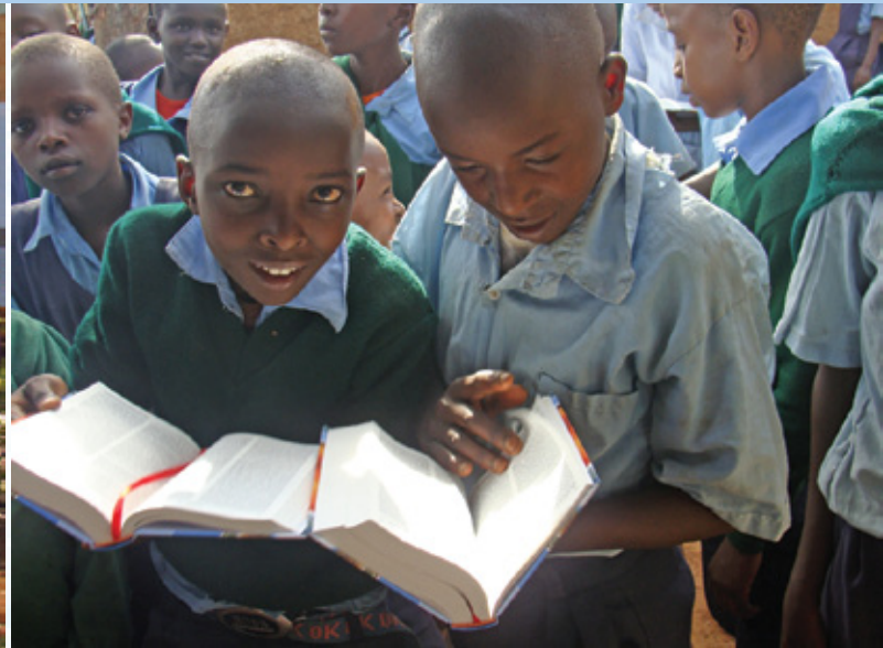
Gategi Primary school children enjoy reading their Bibles from BSK

BSK has distributed Bibles in marginalized areas and children homes in various Counties in the past to ensure children interact with God's word as a tool to bring positive transformation and behaviour change in their lives.