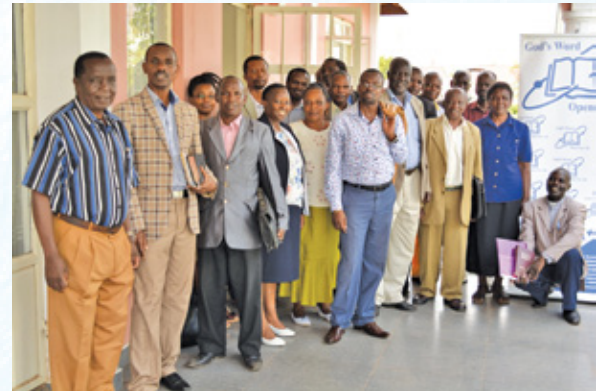
Group photo of BSK Management and the participants