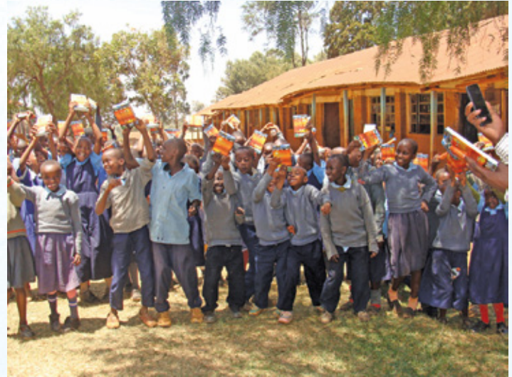
More than joy expressed by these Kianjokoma Primary School children for receiving Bibles from BSK