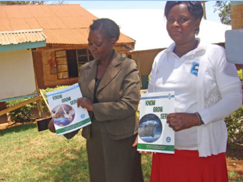
Kianjokoma Primary school teachers appreciate PPI materials